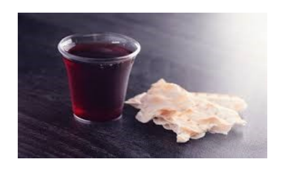
Please send for the free booklet on the Lord's Supper